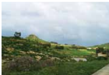
VALLEY NEAR THE BRIDGE