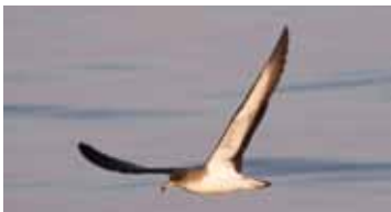
CORY'S SHEARWATER (Nicholas Galea)