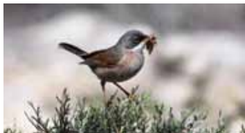
THE SPECTACLED WARBLER (Nicholas Galea)

The types of birds you come across will vary greatly with the time of year. In the hot summer months, many of the common land birds will be either absent or have gone to ground to avoid the intense heat. Those walkers familiar with the seacoasts of more northern countries will likely notice that, outside of breeding or migration periods, there is a comparative absence of sea birds.