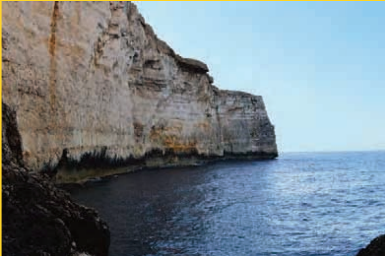
VIEW AT BOTTOM OF GORGE

To take this option, you ramble down the winding road from the Y-junction 7, admiring the pleasant views. At the bottom of this steep road you come to a wide clearing, used as a parking area. From the edge of the car park you can admire the lower cliffs. You should explore this area by walking to the right towards a deep gorge 8 which leads down to the water's edge. The path down to sea level is slightly difficult to follow. At the innermost part of the gorge, next to the car park, take the rocky track along the edge of the valley towards a promontory which divides the gorge in two. On the right of the promontory, a set of rock steps leads downhill along a magnificent (though slippery) path. The views at the bottom are truly wonderful. Back up from the gorge, the path heads left into a clearing, and at its opposite end there is a narrow footpath, along the cliff edge. Take this level path which is generally set safely back from the cliff edge, though there are three sections at which it comes close to the edge. Enjoy the many sights and sounds of this wild coast, and observe the many boulders along the way.