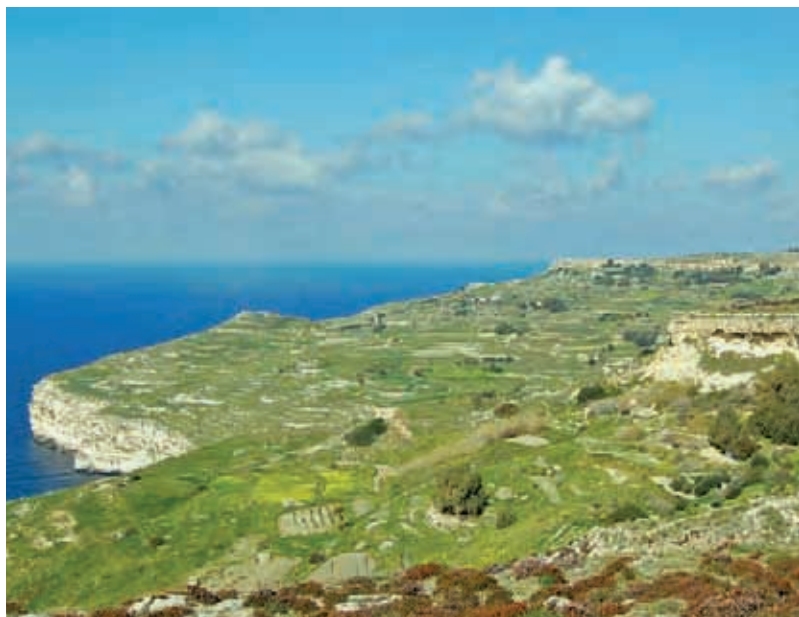
VIEW OF MIGRA L-FERHA

Malta emerged from the sea floor around 8 million years ago and has since been moulded by tectonic activity, sea, wind, rain and humans. Tectonics have played an important role in causing a tilting of Malta towards the north-east. This has resulted in high cliffs along the south (such as at Dingli) and low lying coast along the north-west (such as at Sliema). On the upper Dingli Cliffs you are standing on a layer of tough coralline limestone underlain by an impervious clay layer. Rain falling on the fractured surface of the top layer percolates into the ground until it meets the clay layer. The water then travels sideways to emerge as a spring along the cliff edge. The lower plateau is composed of clay washed out by groundwater and resting on a layer of lower coralline limestone. This fertile lower strip is largely devoted to agricultural, made possible by springs along the cliff walls.