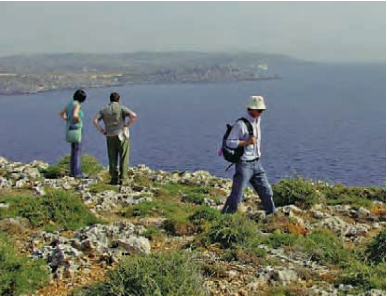
WALKING ALONG THE COASTAL CLIFFS

The Malta Coastal Walk is not a uniform, sign-posted route but a combination of limestone paths, town footpaths and promenades, minor country roads and some sections across open countryside. There are some slightly challenging uphill sections but the route, in the main, is along level paths. The coastal walk can be done by any reasonably fit person with a pair of adequate walking shoes, in all but the worst of weather.