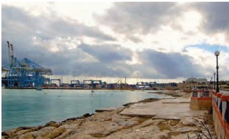
THE PROMENADE WALK

There are opportunities for a coffee and toilet break at Birżebbuġa and Żurrieq, but none in between. Frequent buses will take you from Valletta to Marsaxlokk and from Żurrieq to Valletta.